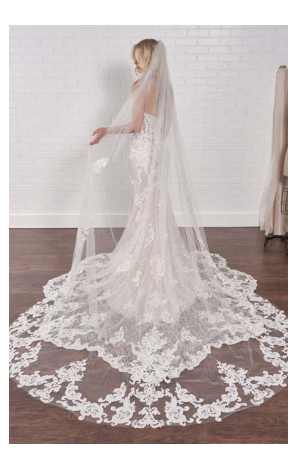
TUSCANY VEIL YYVL+20XS331