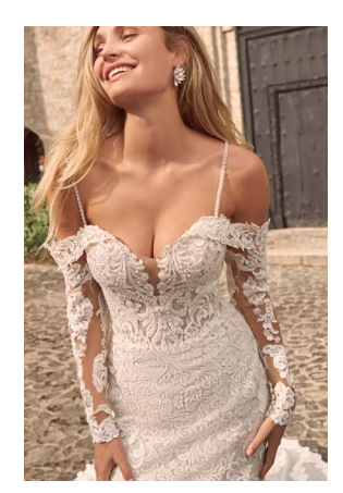
FIONA SLEEVES YYDS0+21MS366000

Gowns available in 10 weeks or less! For your convenience, Quick Ship stickers are available to place on your samples to identify gowns available in the Quick Ship program! Ask your Sales Representative for more details!