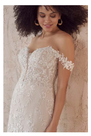
LENNON CAP-SLEEVES YYCS0+22MC913000