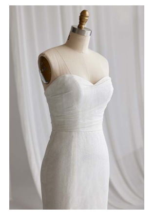
ANNISTON LANE* 23MS618A03