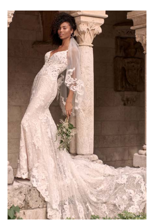
TUSCANY ROYALE* 21MS347A01