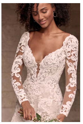
TUSCANY ROYALE SLEEVES DS0+21MS347000