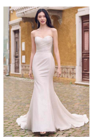
ANNISTON LANE* 23MS618A01