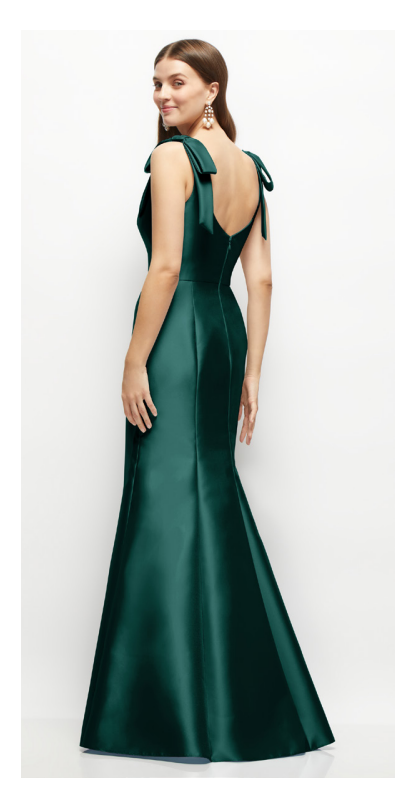
WINSLET DRESS | ALFRED SUNG STYLE D868 | SATIN TWILL | AVAILABLE WITHOUT BOWS AS STYLE D869 | SAMPLED IN COLORS MIST, POWDER PINK, EVERGREEN