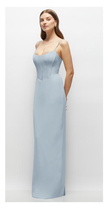
DARCY DRESS | THREAD STYLE TH132 | LUX CHIFFON | SAMPLED IN COLORS CABERNET, OAT, MIST