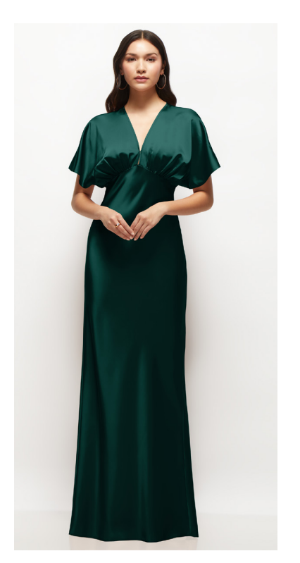
ALMA DRESS | THREAD STYLE TH131 | NEU STRETCH CHARMUESE | SAMPLED IN COLORS SAGE, NEU NUDE, CABERNET