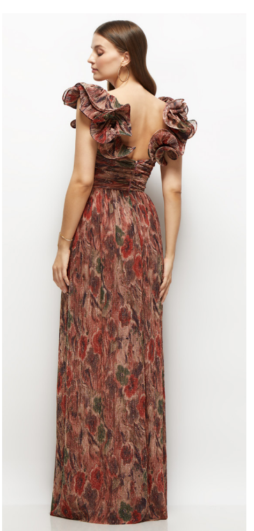
MARGOT DRESS | AFTER SIX STYLE 6883HFP | PLEATED METALLIC | SAMPLED IN HARVEST FLORAL PRINT