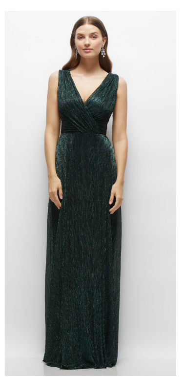
WYLDER DRESS | AFTER SIX STYLE 6895 | PLEATED METALLIC | SAMPLED IN COLORS METALLIC SIENNA, METALLIC TAUPE, METALLIC LILAC, METALLIC EVERGREEN