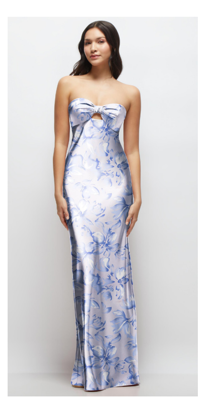
ZEPHYR DRESS | LOVELY STYLE LB058FP | NEU STRETCH CHARMUESE PRINTS | SAMPLED IN COLORS GOLDEN HOUR, VINTAGE PRIMROSE, MAGNOLIA SKY