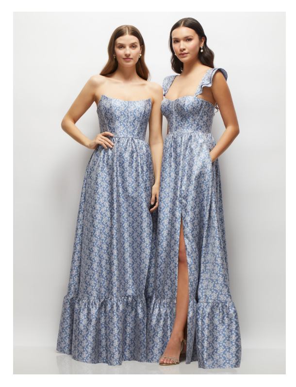
FELICITY & DORSET DRESSES | DESSY COLLECTION STYLES 3146MDJ & 3152MDJ | SATIN TWILL | ADJUSTABLE FLUTTER STRAPS AND POCKETS | SAMPLED IN MARGUERITE DAISY JACQUARD IN CHAMBRAY