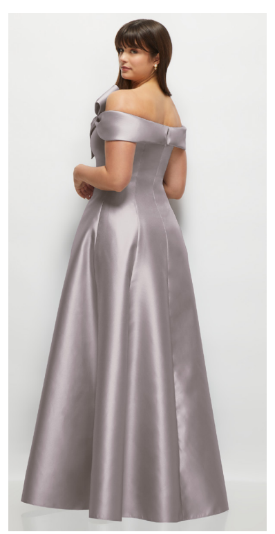
AUDRA DRESS | ALFRED SUNG STYLE D862 | SATIN TWILL | INTERNAL CORSET AND POCKETS | SAMPLED IN COLORS MIDNIGHT NAVY, MIST, CASHMERE GREY