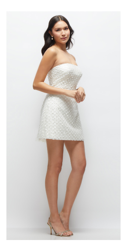
ISOBEL DRESS | DESSY COLLECTION STYLE 3147 | FLORET SEQUIN OVER SATIN TWILL | SAMPLED IN PEARL