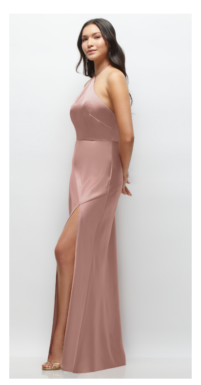
SIA DRESS | LOVELY STYLE LB059 | NEU STRETCH CHARMUESE | SAMPLED IN COLORS OLIVE, CLOUDY, NEU NUDE