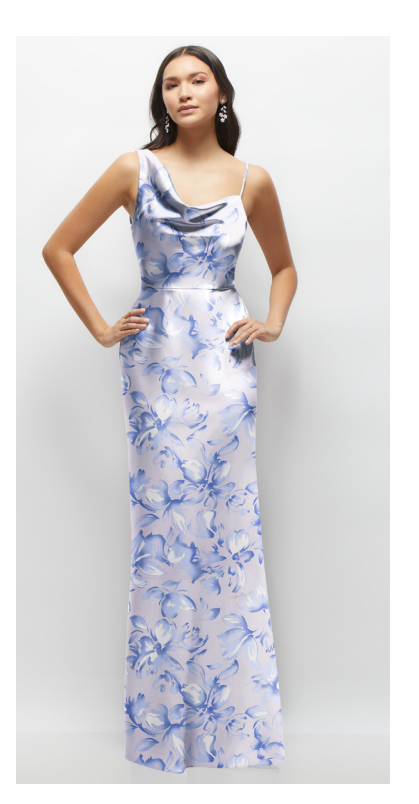
BONNIE DRESS | THREAD STYLE TH130FP | NEU STRETCH CHARMUESE PRINTS | SAMPLED IN COLORS GOLDEN HOUR, VINTAGE PRIMROSE, MAGNOLIA ROSE