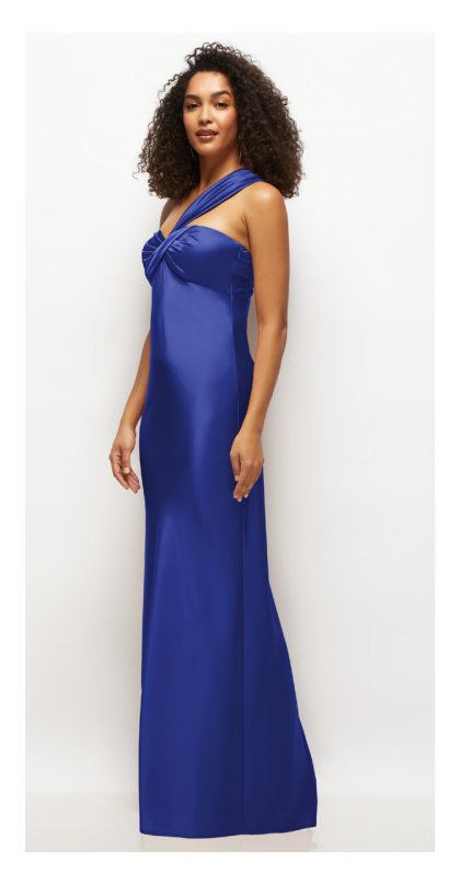
ISOLDE DRESS | AFTER SIX STYLE 6893 | NEU STRETCH CHARMUESE | SAMPLED IN COLORS COPPER PENNY, COGNAC, COBALT BLUE