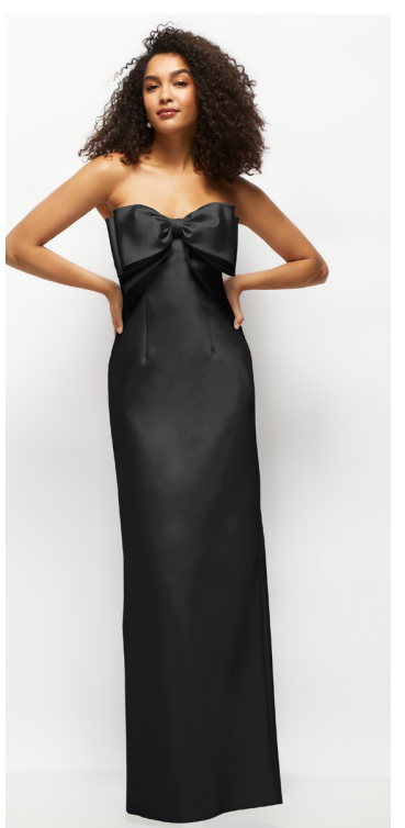
NATASHA DRESS | ALFRED SUNG STYLE D859 | SATIN TWILL | BIAS COLUMN WITH COVERED BUTTON DETAIL AT BACK | SAMPLED IN COLORS BALLET PINK, COGNAC, BLACK