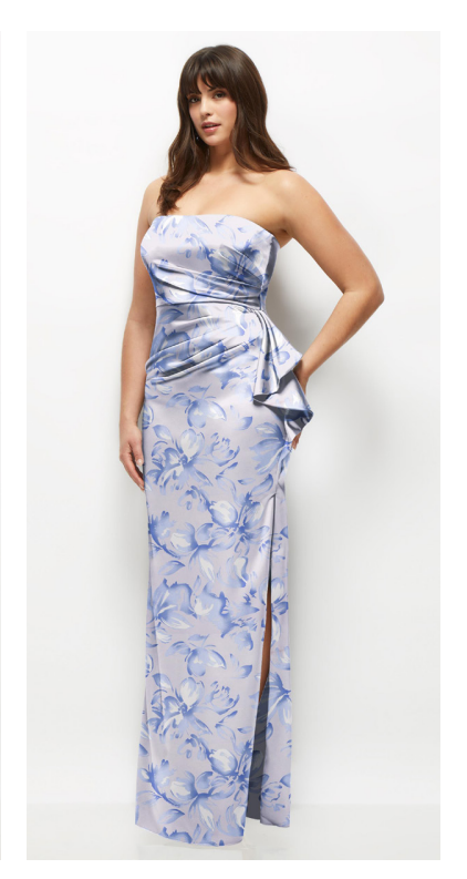
RAYNA DRESS | AFTER SIX STYLE 6894FP | NEU STRETCH CHARMUESE PRINTS | SAMPLED IN COLORS VINTAGE PRIMROSE, GOLDEN HOUR, MAGNOLIA SKY