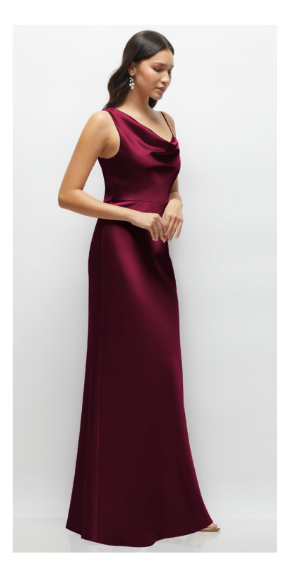
BONNIE DRESS | THREAD STYLE TH130 | NEU STRETCH CHARMUESE | SAMPLED IN COLORS SAGE, NEU NUDE, CABERNET