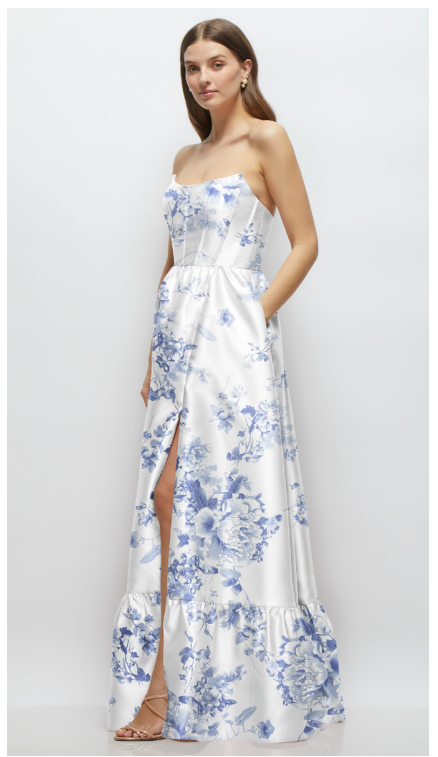
FELICITY & DORSET DRESSES | DESSY COLLECTION STYLES 3146FP & 3152FP | SATIN TWILL | ADJUSTABLE FLUTTER STRAPS AND POCKETS | SAMPLED IN COTTAGE ROSE LARKSPUR