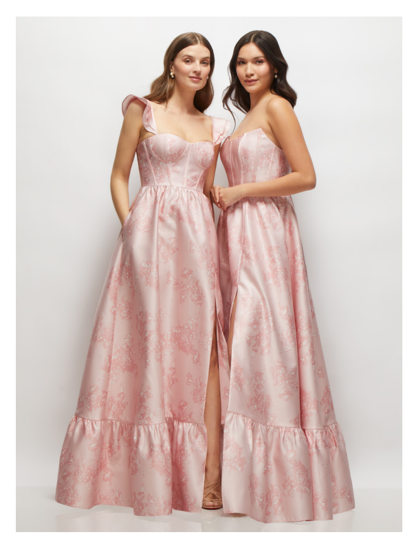
FELICITY & DORSET DRESSES | DESSY COLLECTION STYLES 3146FP & 3152FP | SATIN TWILL | ADJUSTABLE FLUTTER STRAPS AND POCKETS | SAMPLED IN BOW AND BLOSSOM PRINT