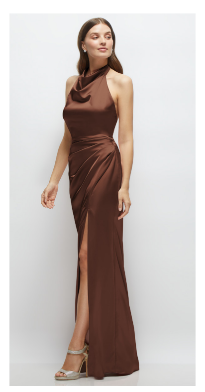
NOOR DRESS | LOVELY STYLE LB060 | NEU STRETCH CHARMUESE | SAMPLED IN COLORS EVERGREEN, MIDNIGHT NAVY, COGNAC