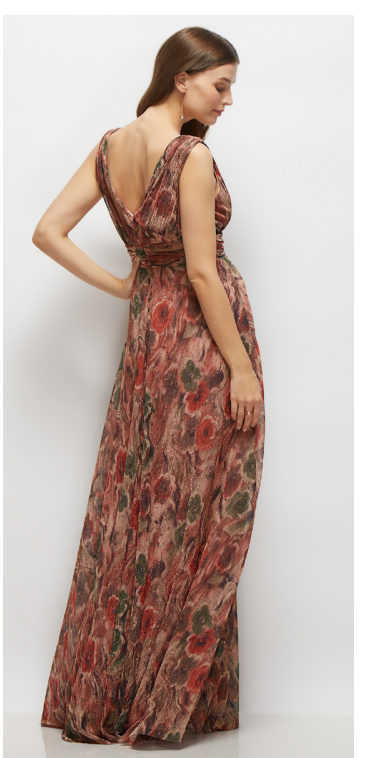
ORLA & WYLDER DRESSES | AFTER SIX STYLS 6884HFP & 6895HFP | PLEATED METALLIC | SAMPLED IN HARVEST FLORAL PRINT