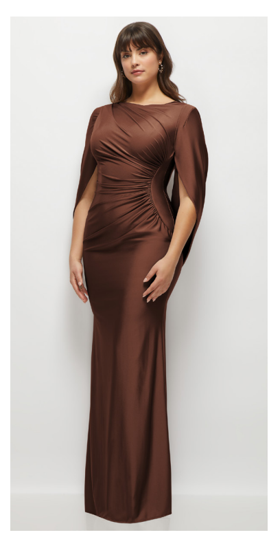
CHLOE DRESS | AFTER SIX STYLE 6897 | LUXE STRETCH SATIN | SAMPLED IN COLORS CASHMERE GRAY, COBALT BLUE, COGNAC