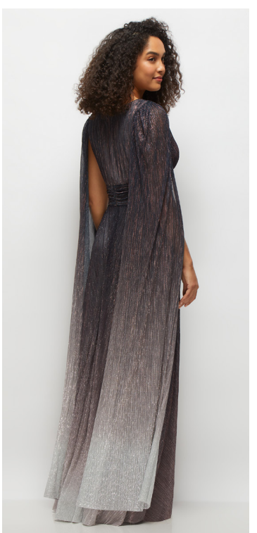
LUNA DRESS | AFTER SIX STYLE 68960MB | PLEATED METALLIC OMBRE | SAMPLED IN COLORS COSMIC BLUE, PLUM NOIR