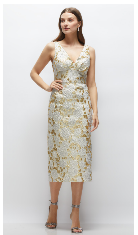
CAMILLA DRESS | DESSY COLLECTION STYLE 3151 | GOLD LEAF BROCADE | SAMPLED IN COLORS WINTER MIST, WINTER ROSE