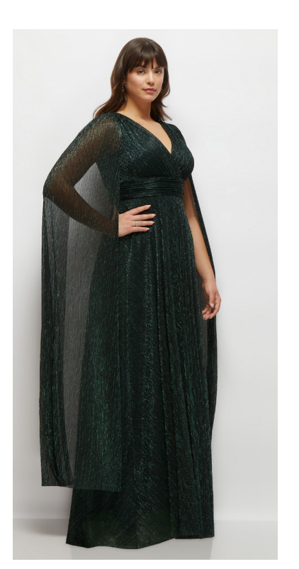
LUNA DRESS | AFTER SIX STYLE 6896 | PLEATED METALLIC | SAMPLED IN COLORS METALLIC TAUPE, METALLIC SIENNA, METALLIC EVERGREEN