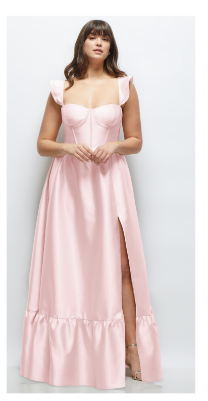
FELICITY DRESS | DESSY COLLECTION STYLE 3146 | SATIN TWILL | ADJUSTABLE FLUTTER STRAPS AND POCKETS | SAMPLED IN COLORS WILLOW GREEN, LILAC HAZE, BALLET PINK