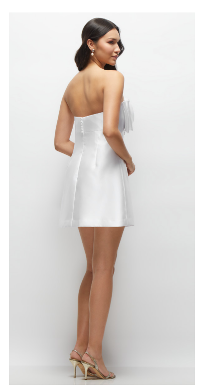
OLIVIER DRESS | ALFRED SUNG STYLE D866 | SATIN TWILL | SAMPLED IN WHITE Pearl trimmed bow and covered button detail at back.