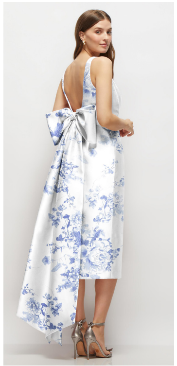
\label{eq:maximaxi} \mbox{MAVI DRESS | ALFRED SUNG STYLE D860FP | SATIN TWILL PRINTS | SAMPLED IN COTTAGE ROSE LARKSPUR Your 'something blue'.}