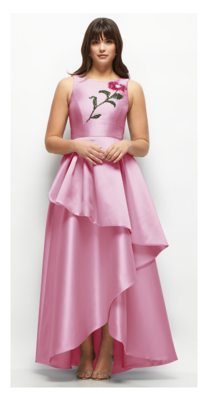
SOLEIL DRESS | ALFRED SUNG STYLE D867BEAD | SATIN TWILL W/ BEADED FLORAL MOTIF | HAND BEADED APPLIQUE AND POCKETS - AVAILABLE WITHOUT BEADING AS STYLE D867 | SAMPLED IN COLORS MIDNIGHT NAVY, MIST, POWDER PINK