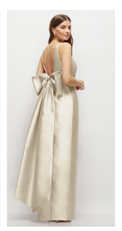
LONDON DRESS | ALFRED SUNG STYLE D865 | SATIN TWILL | SAMPLED IN COLORS EVERGREEN, MIDNIGHT NAVY, CHAMPAGNE