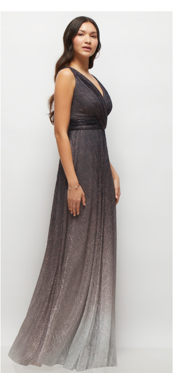
WYLDER DRESS | AFTER SIX STYLE 68950MB | PLEATED METALLIC OMBRE | SAMPLED IN COLORS COSMIC BLUE, PLUM NOIR