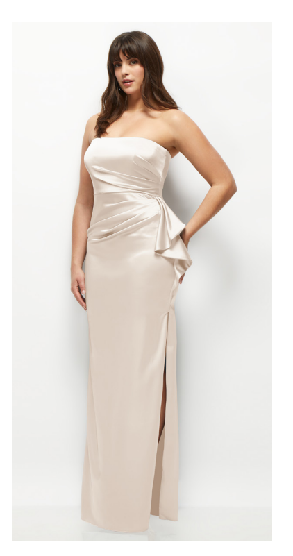
RAYNA DRESS | AFTER SIX STYLE 6894 | NEU STRETCH CHARMUESE | SAMPLED IN COLORS SAGE, AUBURN MOON, OAT