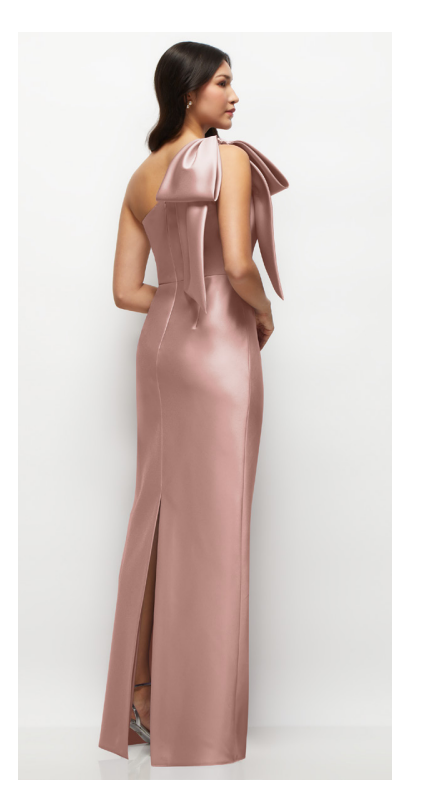
CALLA DRESS | ALFRED SUNG STYLE D861 | SATIN TWILL | SAMPLED IN COLORS COBALT BLUE, EVERGREEN, NEU NUDE