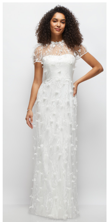
MARTA DRESS | DESSY COLLECTION STYLE 3145 | 3D TRELLIS EMBROIDARY | SAMPLED IN COLORS MIDNIGHT NAVY, SILVER DOVE, EVERGREEN, IVORY