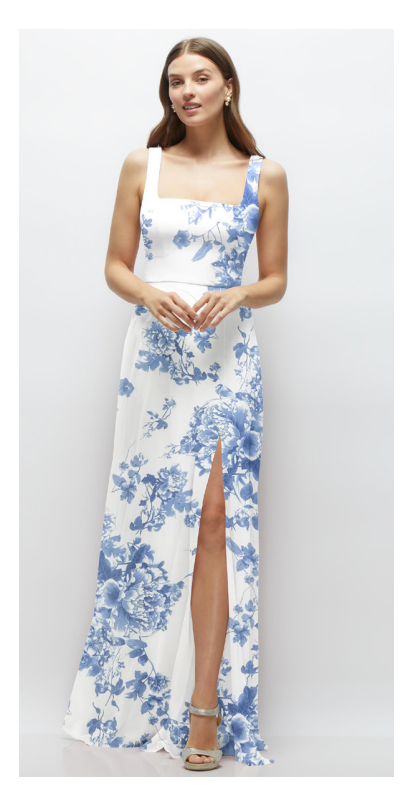
ALEXA DRESS | THREAD STYLE TH134 | LUX CHIFFON | SAMPLED IN COLORS TERRACOTTA COPPER, CELADON, COTTAGE ROSE PRINT