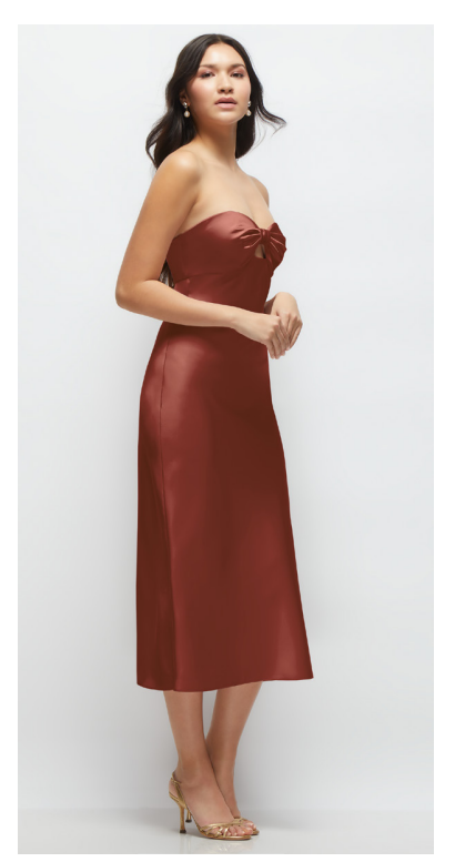
SOL DRESS | LOVELY STYLE LB057 | NEU STRETCH CHARMUESE | SAMPLED IN COLORS CASHMERE GRAY, COPPER PENNY, AUBURN MOON