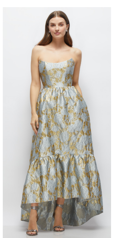
GIA & LENA DRESS | DESSY COLLECTION STYLE 3148 & 3149 | GOLD LEAF BROCADE | POCKETS | SAMPLED IN COLORS WINTER ROSE, WINTER MIST