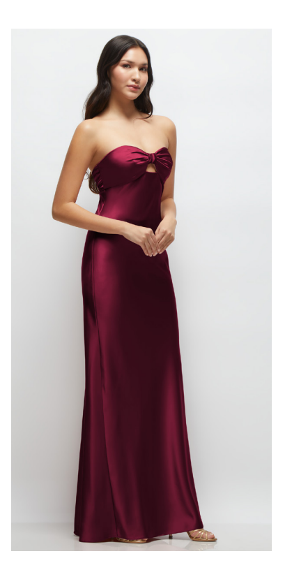
ZEPHYR DRESS | LOVELY STYLE LB058 | NEU STRETCH CHARMUESE | SAMPLED IN COLORS SAGE, OAT, CABERNET