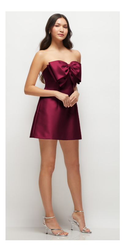
MAVI DRESS | ALFRED SUNG STYLE D860 | SATIN TWILL | COVERED BUTTON DETAIL AT BACK | SAMPLED IN COLORS CHAMPAGNE, CLOUDY, CABERNET