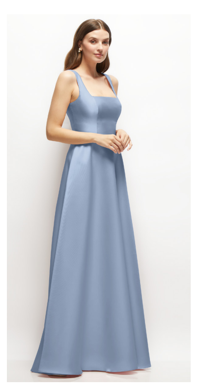
ACE DRESS | DESSY COLLECTION STYLE 3153 | SATIN TWILL | POCKETS | SAMPLED IN COLORS MIDNIGHT NAVY, THINK PINK, CLOUDY