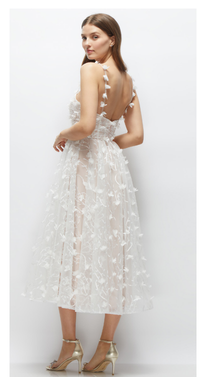
JUNE DRESS | DESSY COLLECTION STYLE 3144 | 3D TRELLIS EMBROIDERY | SAMPLED IN IVORY OVER CAMEO