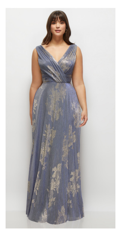
WYLDER DRESS | AFTER SIX STYLE 6895FP | PLEATED METALLIC | SAMPLED IN COLORS PINK FOIL, LARKSPUR GOLD, FRENCH BLUE GOLD