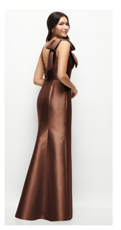
LINDEN DRESS | ALFRED SUNG STYLE D863 | SATIN TWILL | SAMPLED IN COLORS MIST, WILLOW GREEN, COGNAC