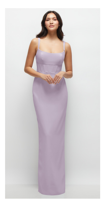
SCOUT DRESS | THREAD STYLE TH133 | LUX CHIFFON | SAMPLED IN COLORS EVERGREEN, POWDER PINK, LILAC HAZE