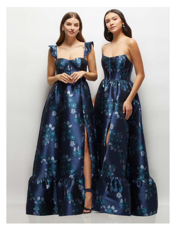
FELICITY & DORSET DRESSES | DESSY COLLECTION STYLES 3146BRD & 3152BRD | SATIN TWILL | ADJUSTABLE FLUTTER STRAPS AND POCKETS | SAMPLED IN BAROQUE ROSE DAMASK IN MIDNIGHT NAVY